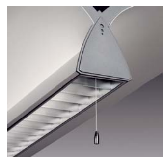
The light level on designs featuring dimming is adjusted using a pull switch.