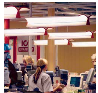
Indigo Cash was developed to be used above cash registers.

Indigo Cash is as standard supplied with mains cable and plug. If you prefer to do the electrical installation via a terminal block inside the ceiling cup, you should order wire suspensions from the luminaire Zora (page 59) under item 1. The mains cable fitted on the luminaire should then be removed.